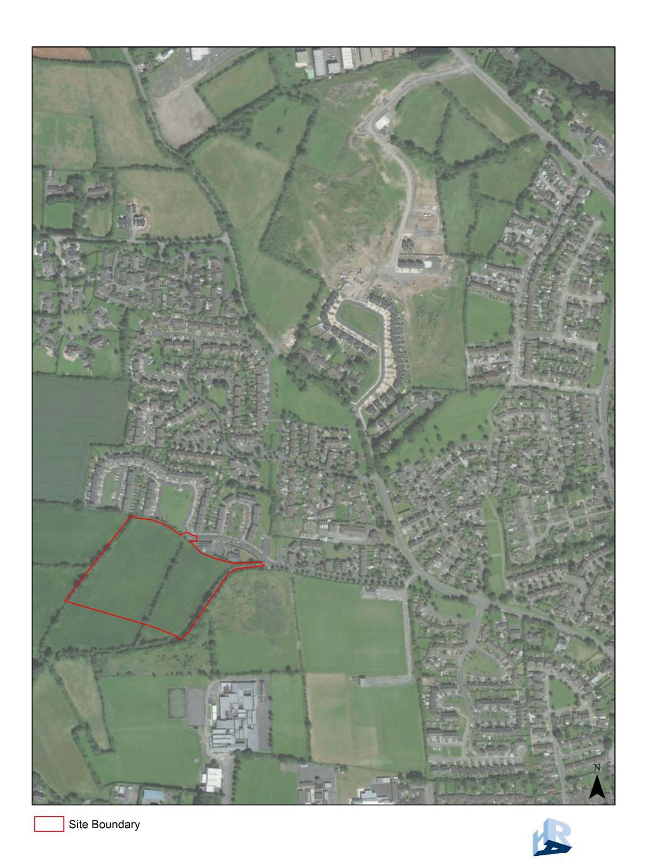
Figure 1.0 Site Location Map

HRA | PLANNING chartered town planning consultants